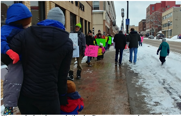
We marched and prayed silently. Protesters were there against our Prayer March for Life, but we prayed for them and didn't interact.